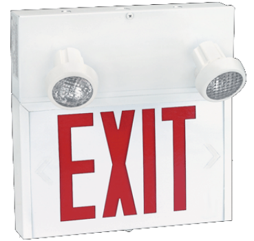
STXC Steel Combo