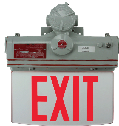
HLEDG Hazardous Location Edgelit