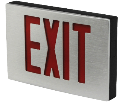
CA Cast Aluminum Exit